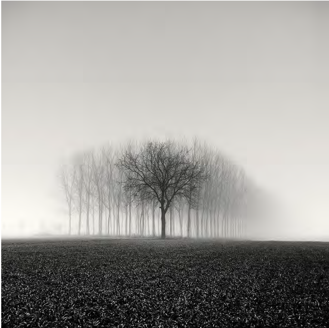
Pierre Pellegrini: Solo In Mezzo A Tanti / Photography