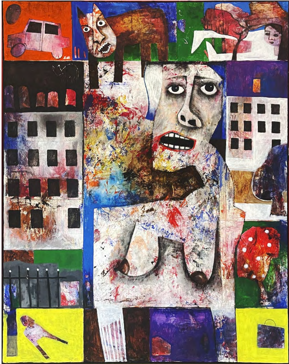
Marco Lupi: Tra Le Case della Memoria / Mixed Media Painting on Canvas, 150 x 200 cm, 2022