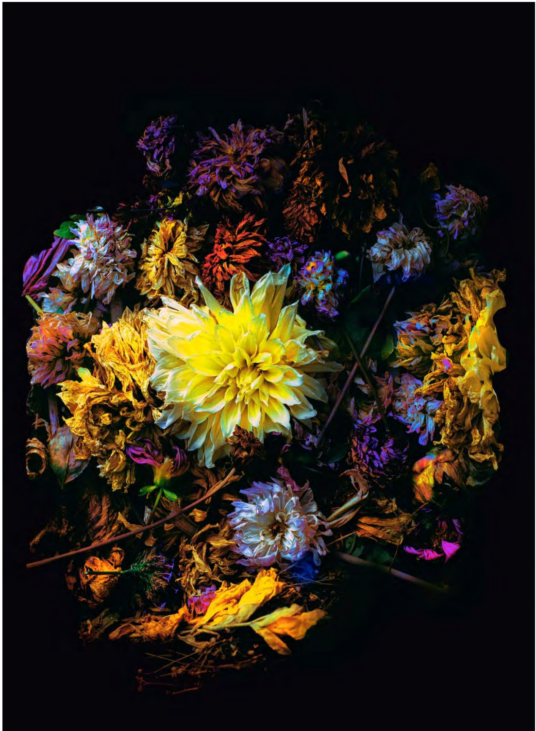
Yuri Catania: «Death In Colors» from the series Black Flower Secret Garden / Photography, 62 x 92 cm