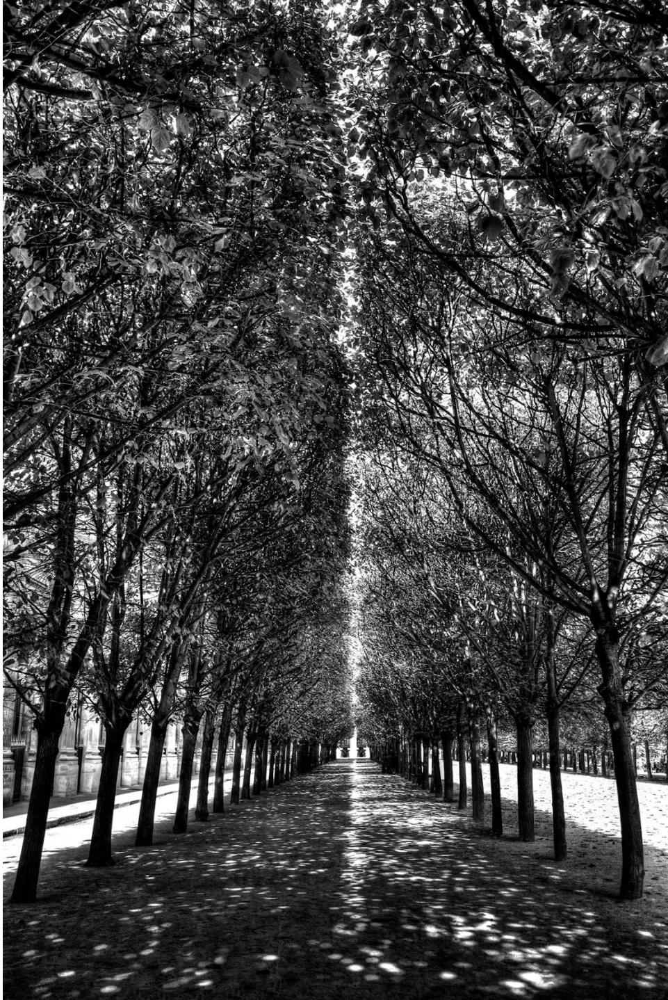
Marshall Vernet: Palais-Royal Light / Photography, 118 x 84,7 cm