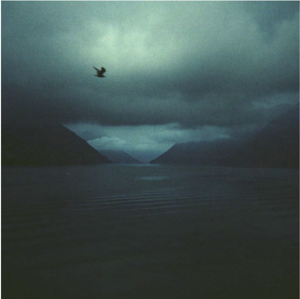
Lorita Catarin Preiano: L'atmosphère du matin / Photography, 2021