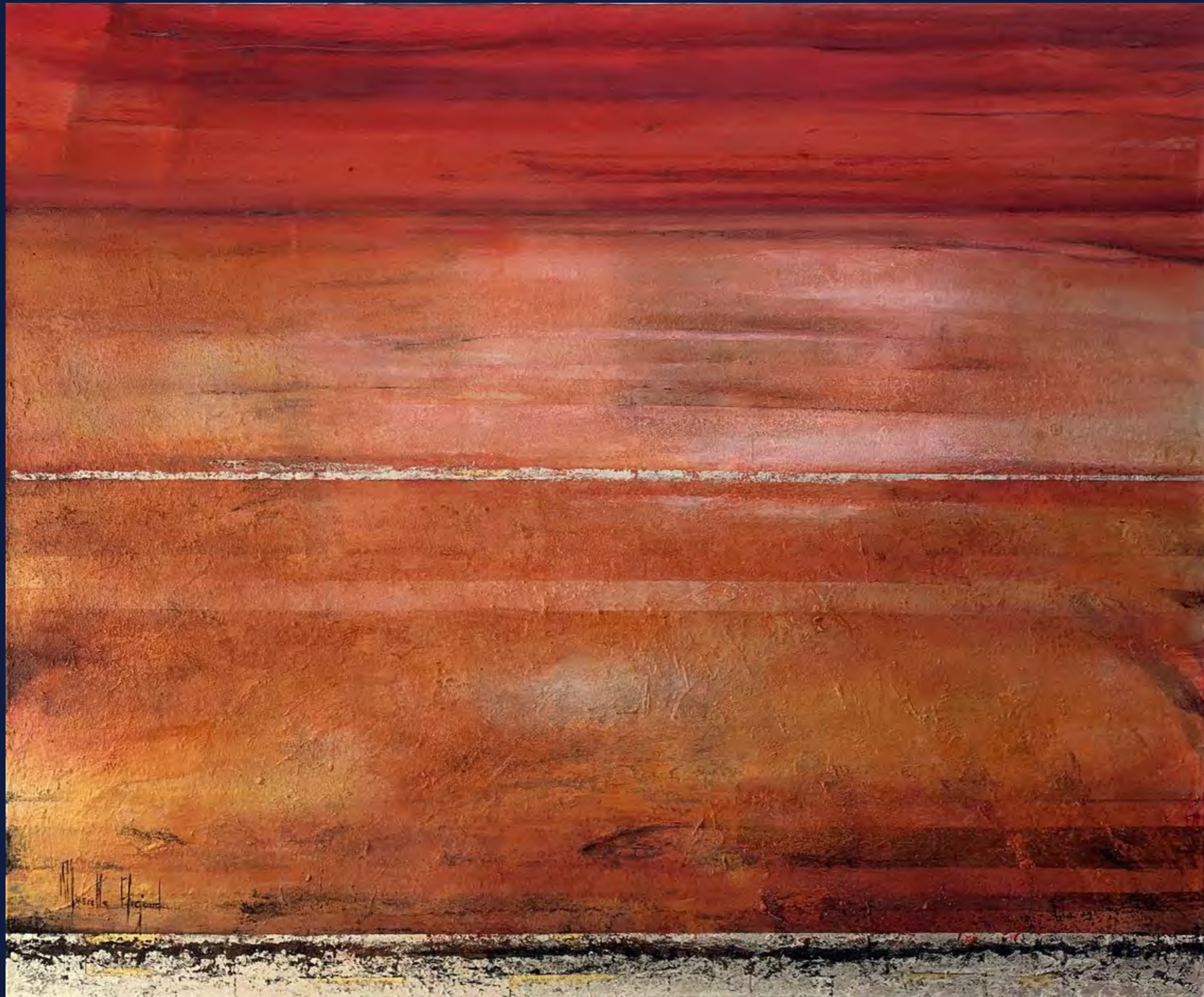
Silent dream (100 x 120cm)