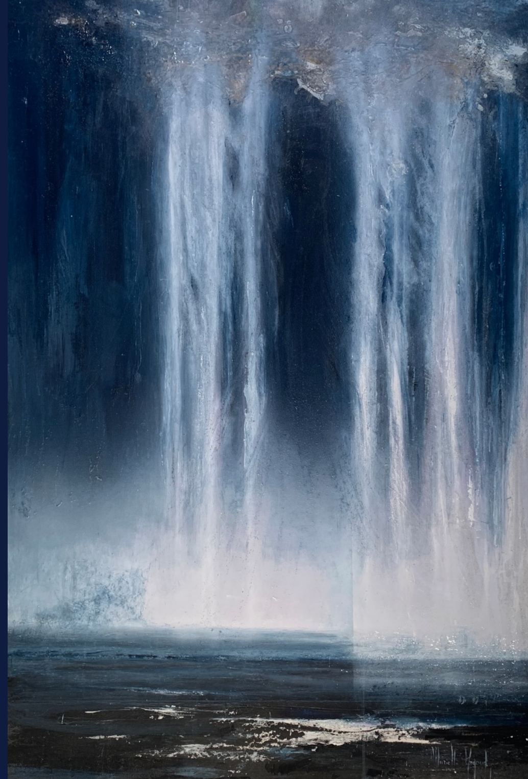
Variation - Fluctus Lumen 2021 (150 x100cm)

Creating stillness for the song of the painting to become audible Creating stillness for deeper contemplation - no wish to analyse or understand. To be ready to Receive