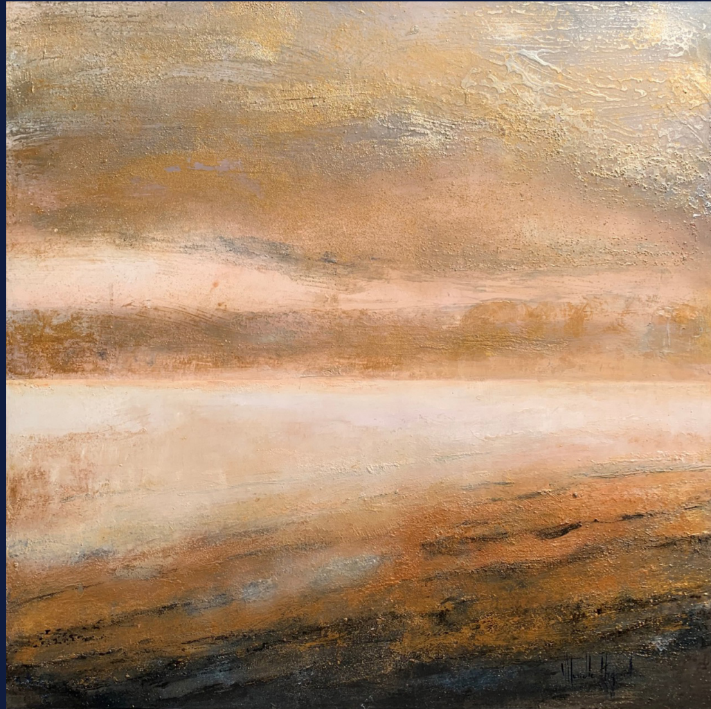
Breath imprint (100 x 100cm)