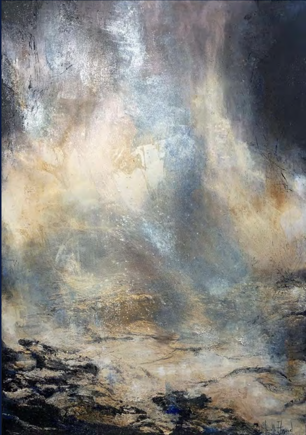
The crossing of silence (150 x 100cm)