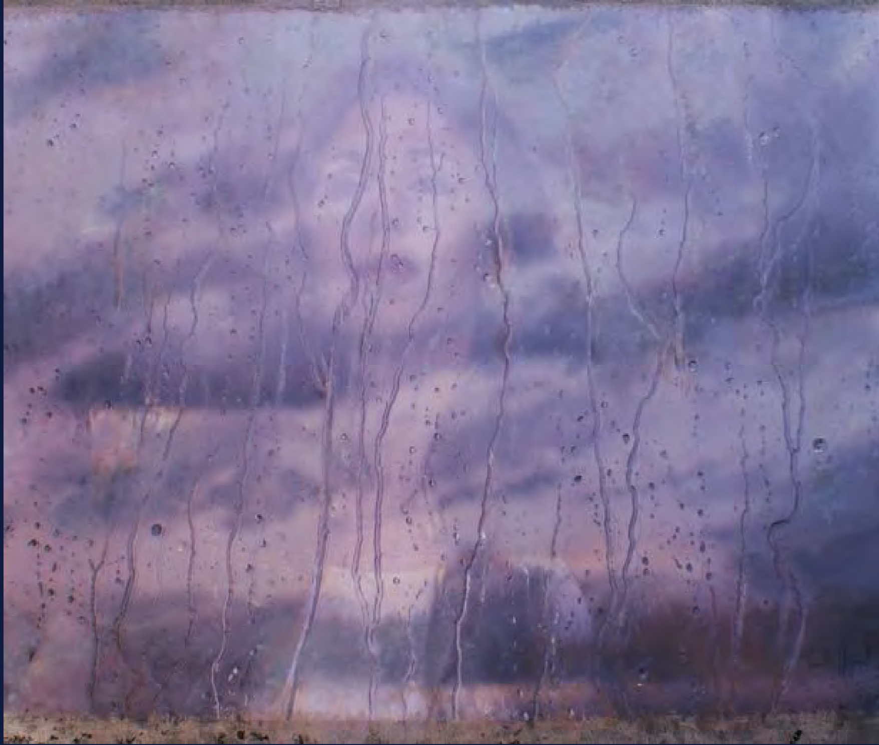
OPUS 28 Nr 4 Chopin (110 x 130cm)