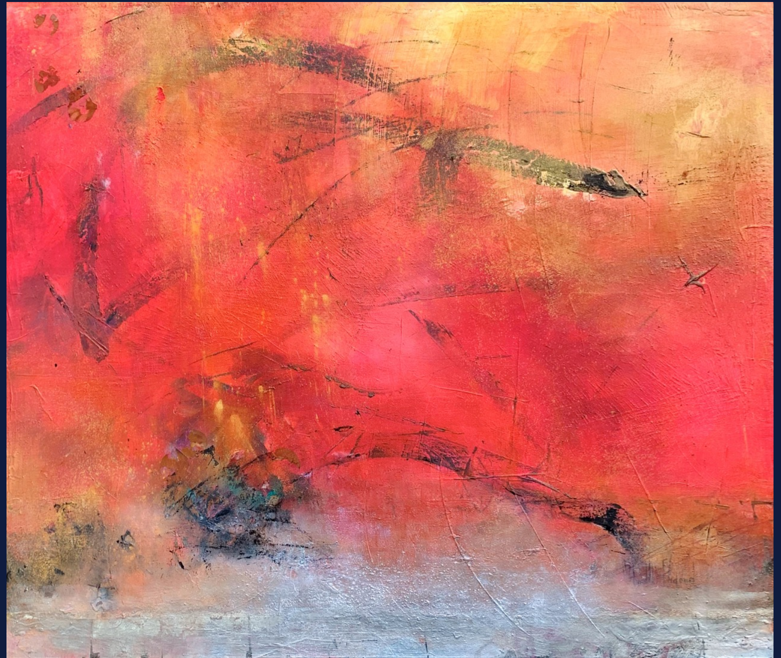
All pink tears F.Cheng 100 x 120cm