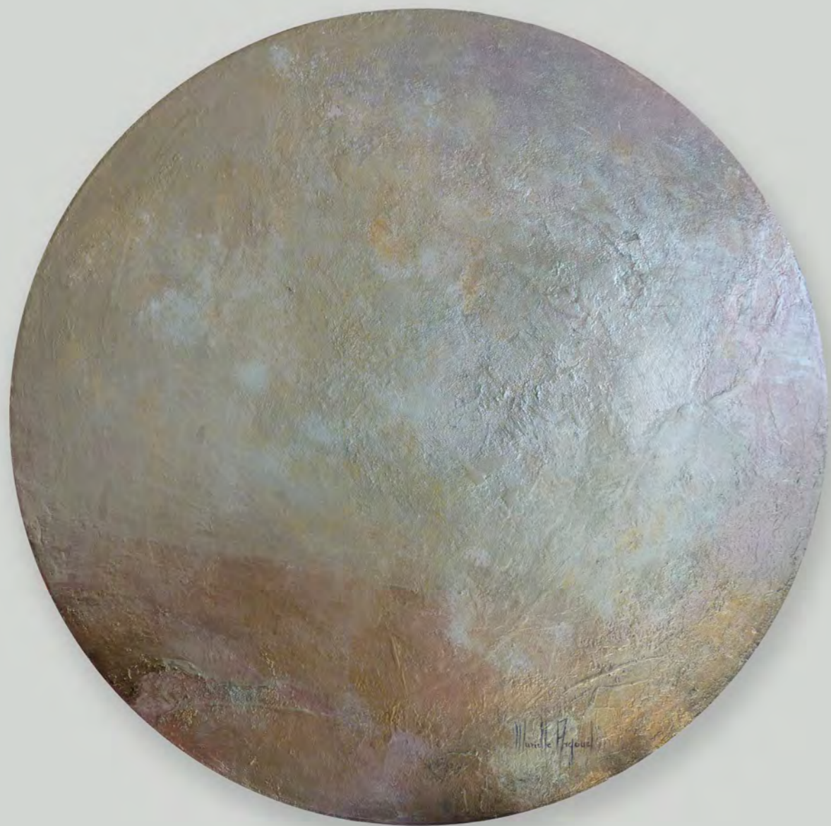
Eternal ephemeral - Venus (d 100cm)