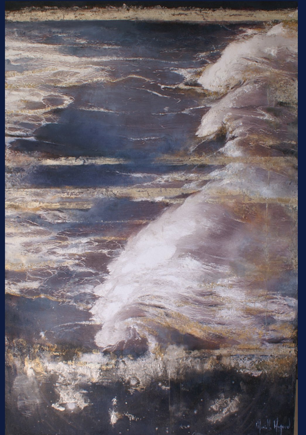
Merging time 150 x 100cm