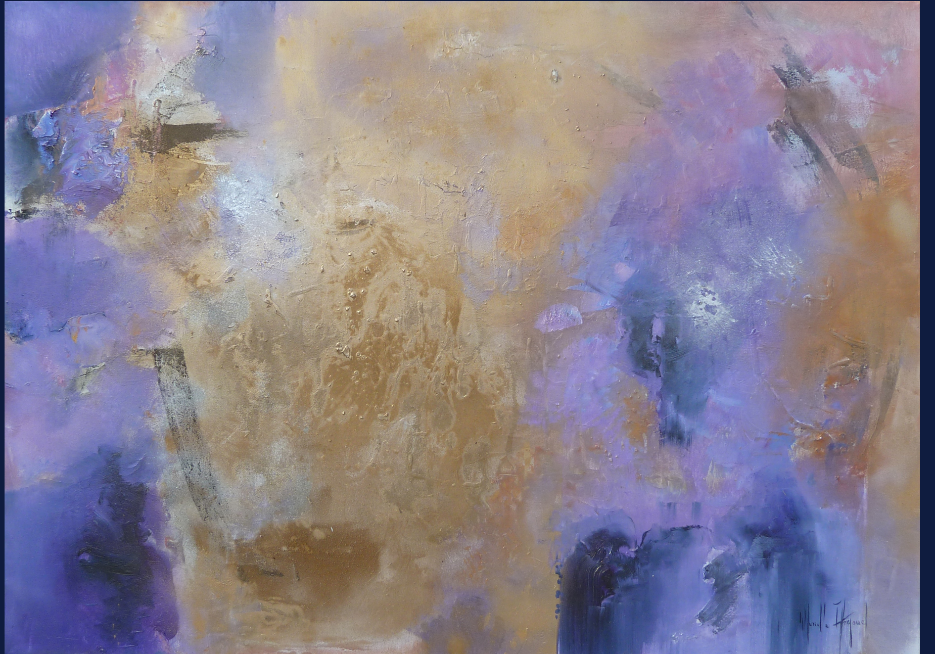
Everlasting Hope - Gold (120 x140cm)

Innate to painting is the suggestion of the ineffable. The breath of infinity incessantly sways the beauty that lies between the visible and the invisible. Through the gesture of nature, through the original archetypes: The backwash of the ocean, the dawn of time, mirrors reflecting light... In short, grace holding out its hand, from tenderness to ardour, from chaos to harmony. That's life!