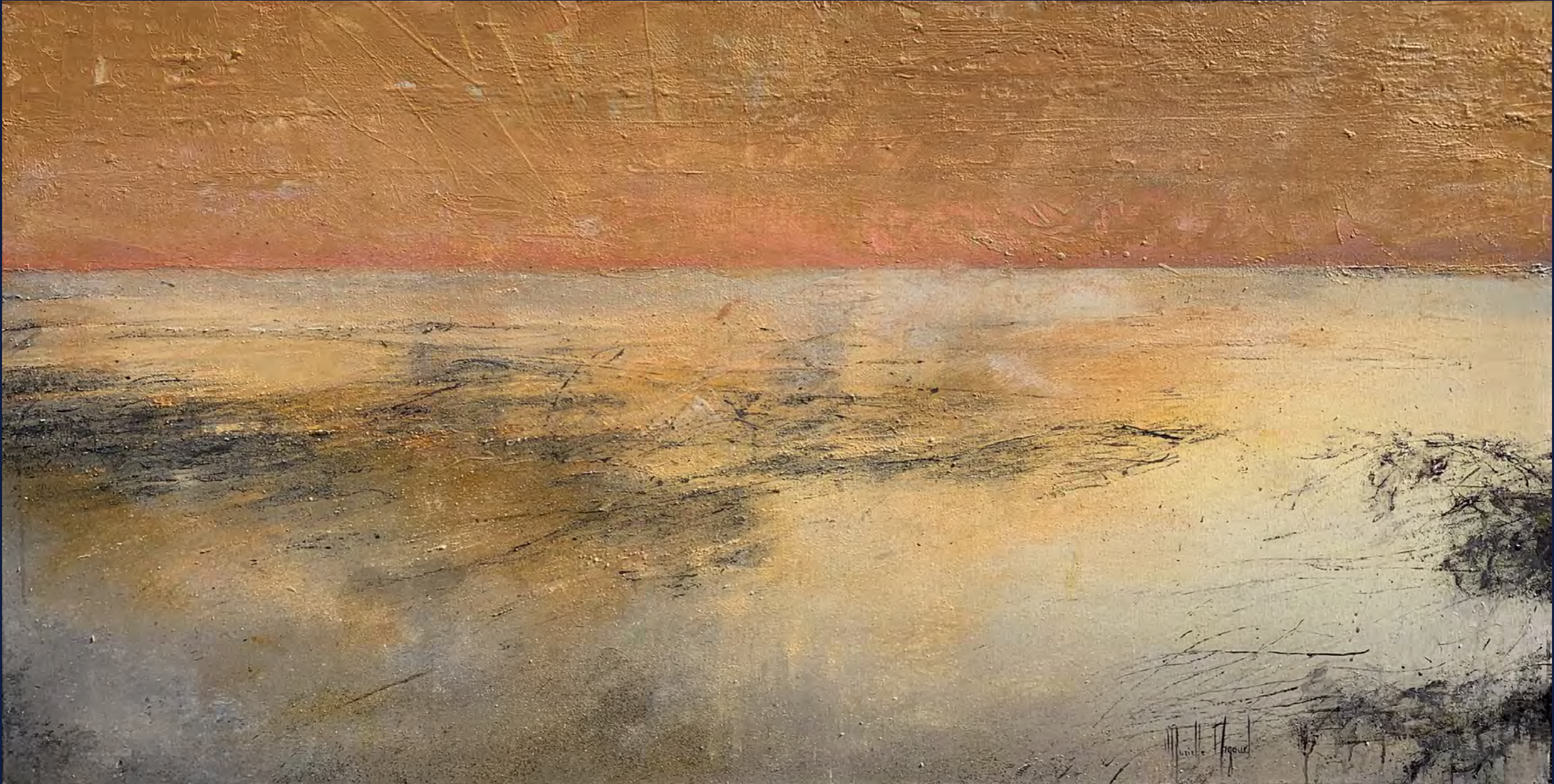
Feu-Soleil-Lumière (80x160cm SOLD)