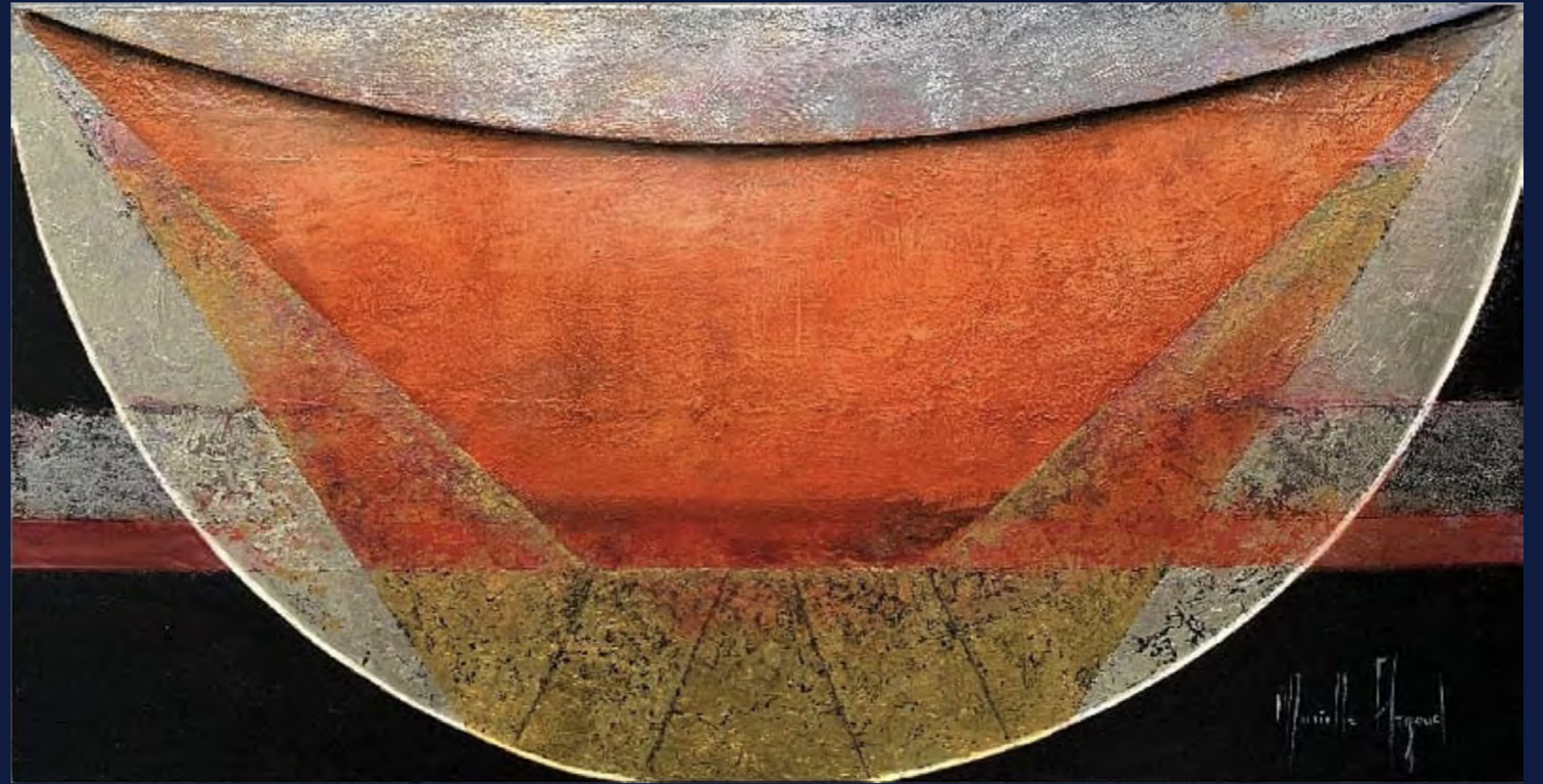
The Grail (50 x 100cm SOLD)