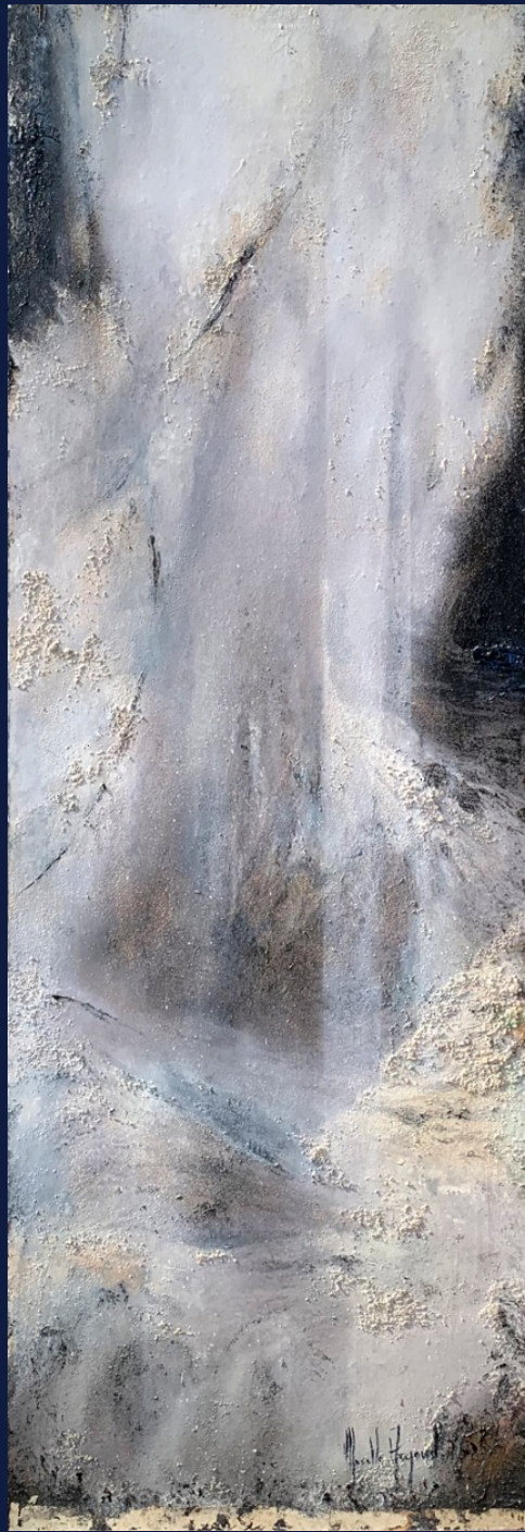
Fluctus Lumen - (150 x 50cm)