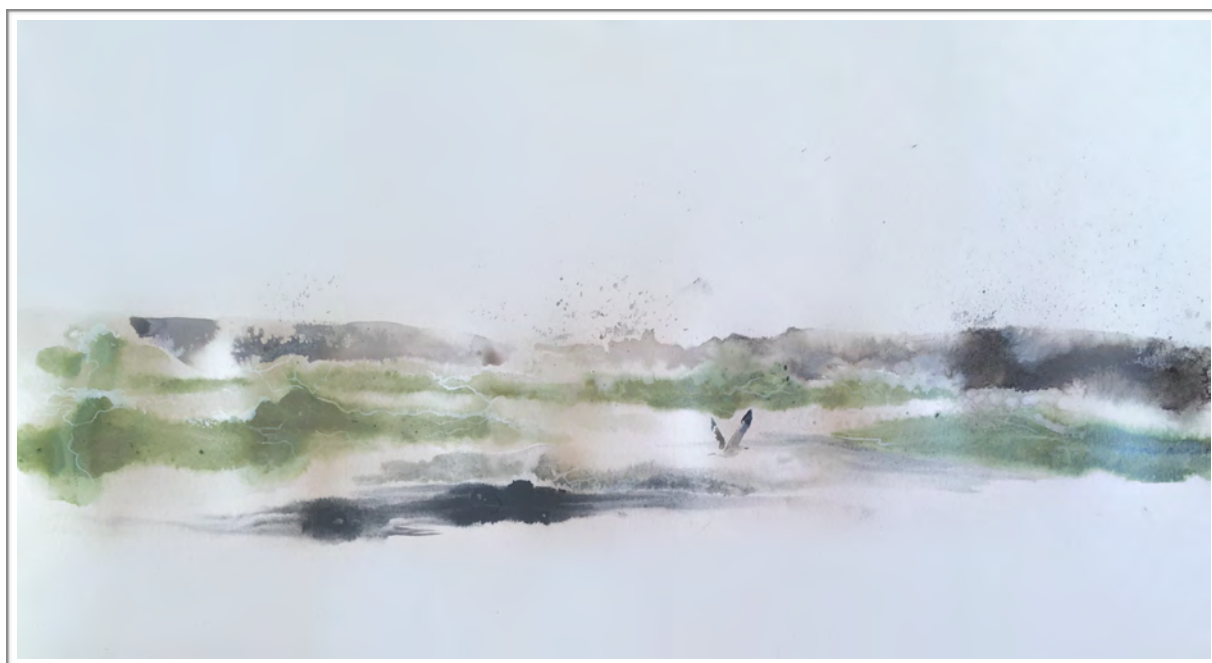
“Leaving Bird Island”