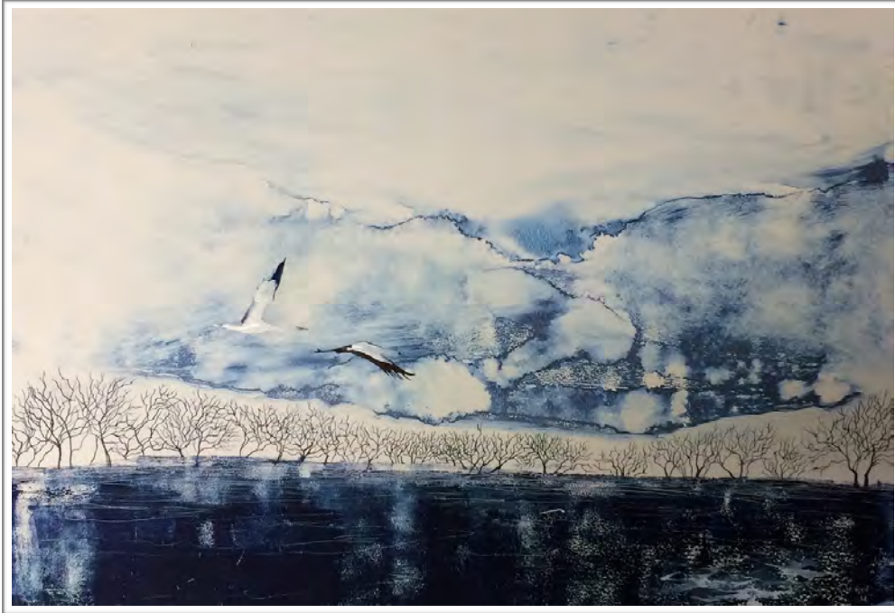
“Kraniche Im Weiten Himmel” Ink painted monoprint on cotton paper h:65cm x w:85cm SOLD