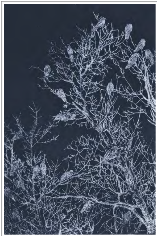
“Pause” Drypoint etching /4 h: 42cm x w:35cm