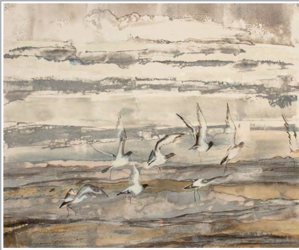
"Estuary" Monoprint on cotton paper h:33cm x w:25cm SOLD