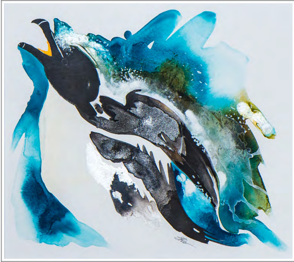
“Razorbill in the Surf”