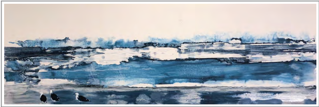
“Three Gulls” Monoprint h:42cm x w:86cm