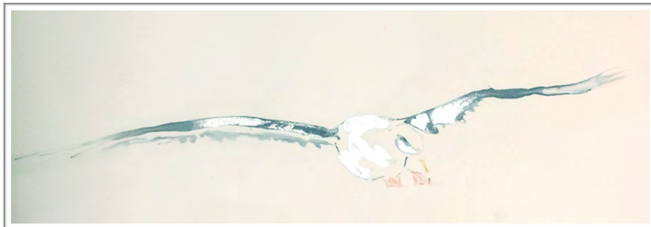
“Off Kilter” Ink on cotton paper h:60cm x w:33cm SOLD