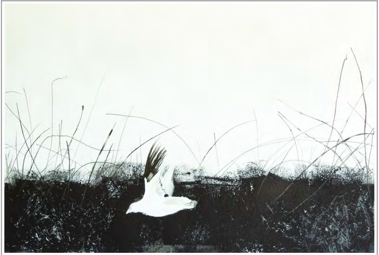
“The Minder” Monoprint & ink h:65cm x w:85cm