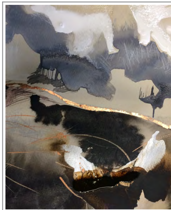
"Scorched Earth i" Ink, pencil & copper leaf on cotton paper h:33cm x w:25cm SOLD