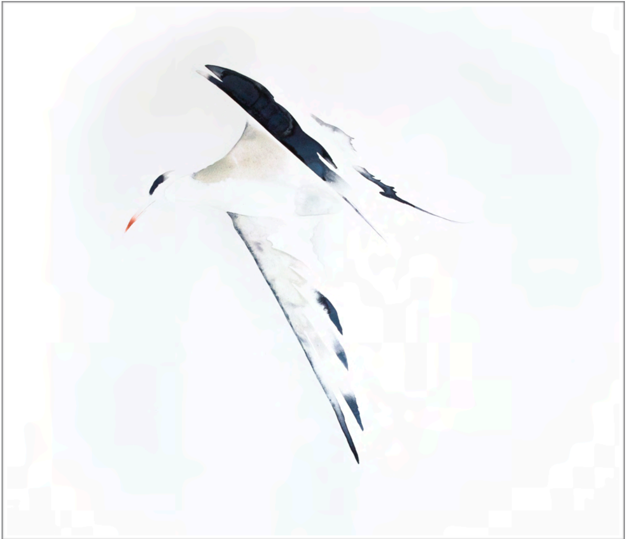
“Sylph” Ink on cotton paper h:91cm x w:91cm