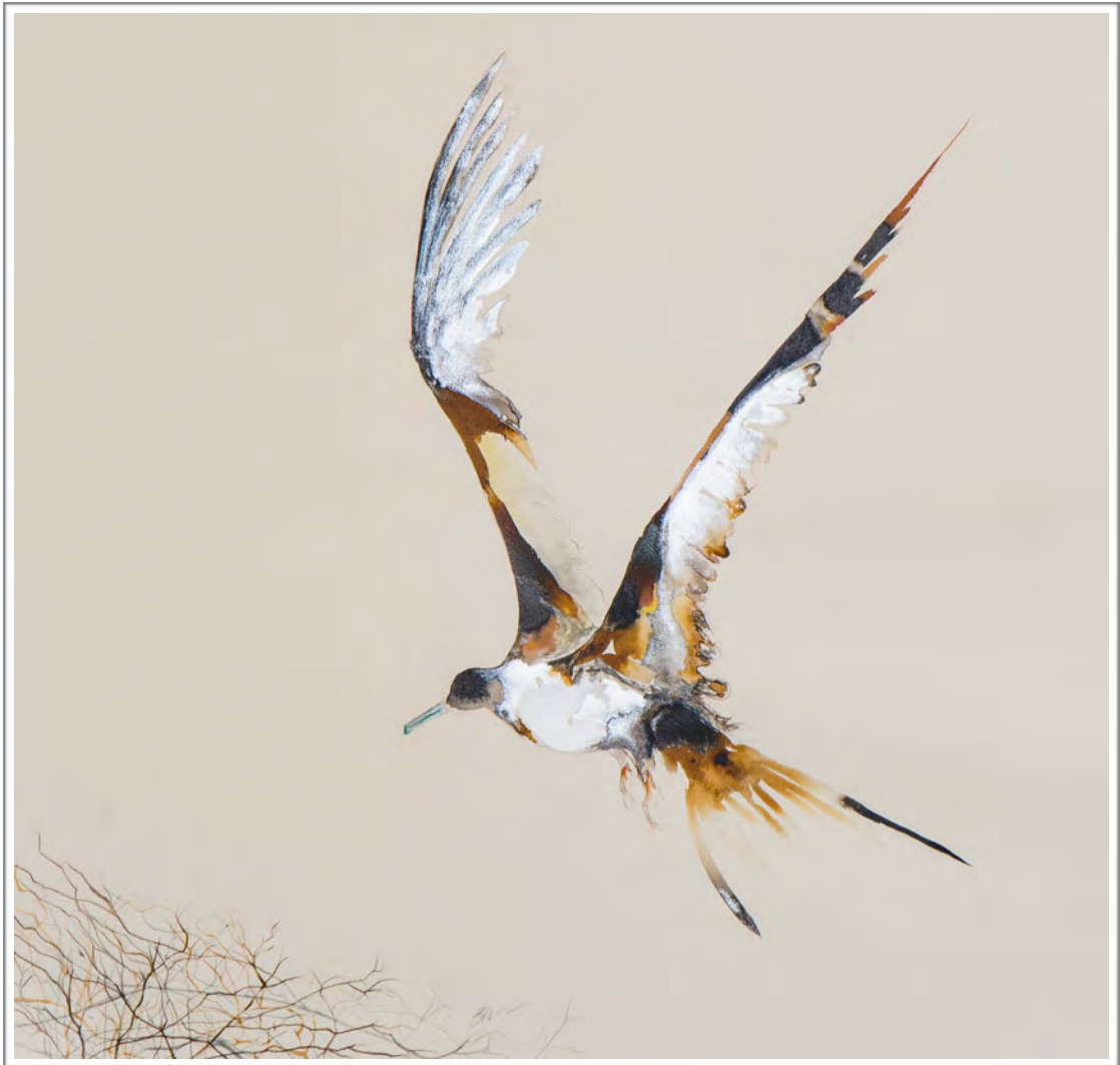
“Above the Tangle”