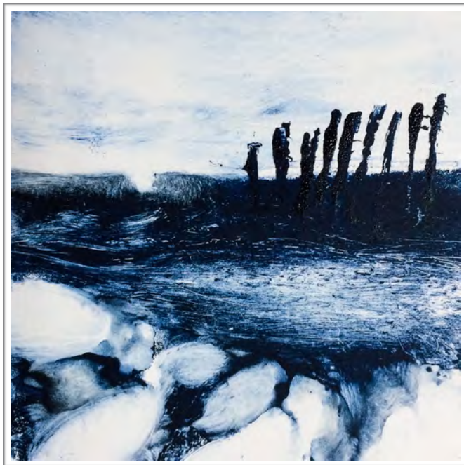
“Lonesome Sentries iii” Monoprint on cotton paper h:30cm x w:30cm