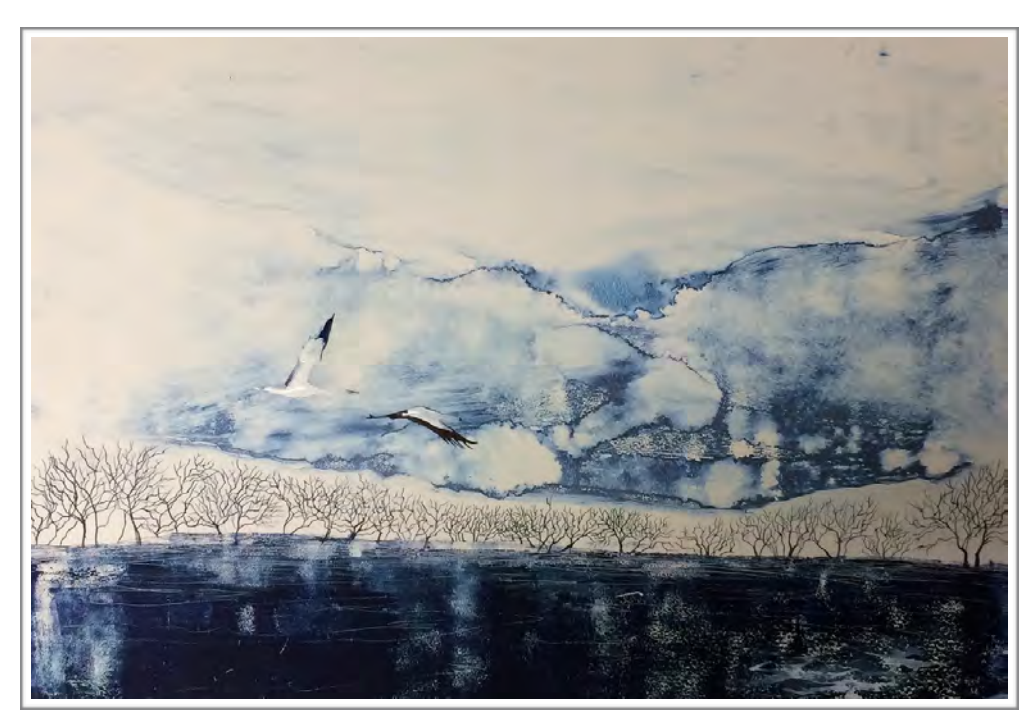
"Kraniche Im Weiten Himmel" Ink painted monoprint on cotton paper h:65cm x w:85cm SOLD