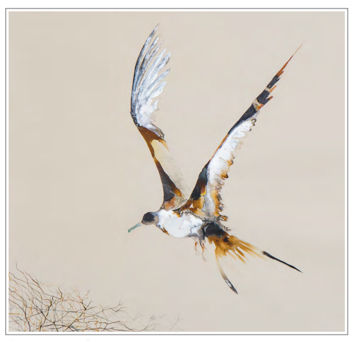
"Above the Tangle" Ink & pencil on cotton paper h:85cm x w:85cm SOLD