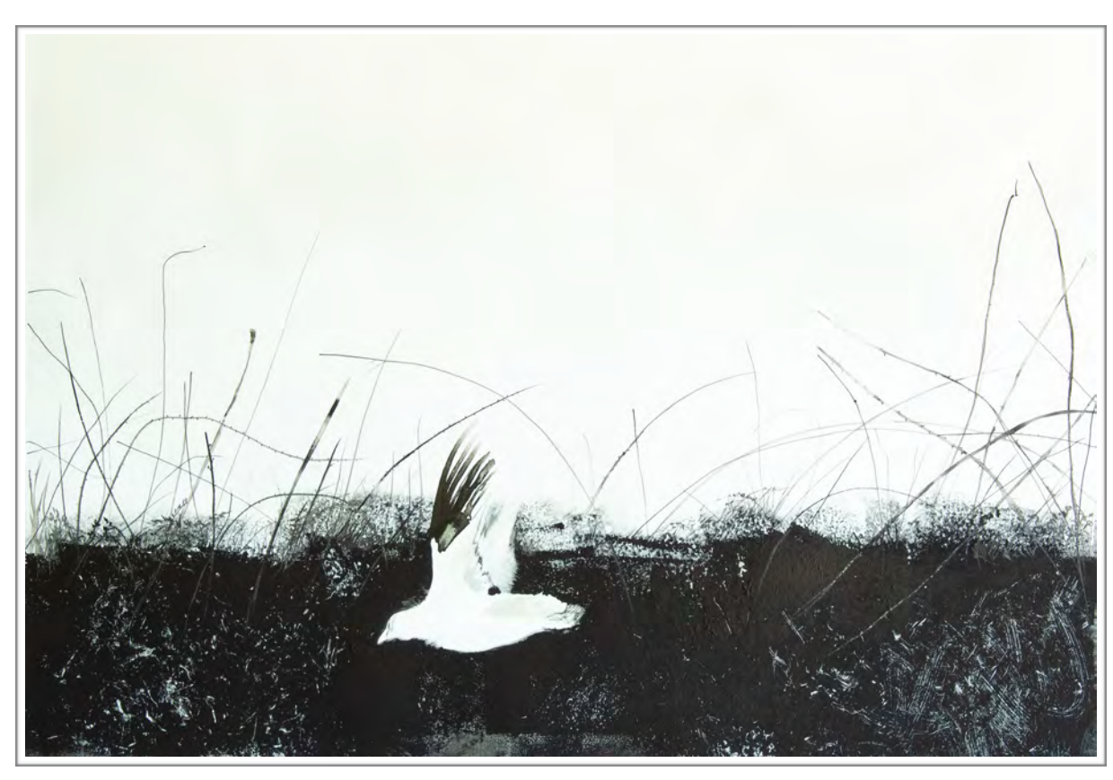
"The Minder" Monoprint & ink h:65cm x w:85cm