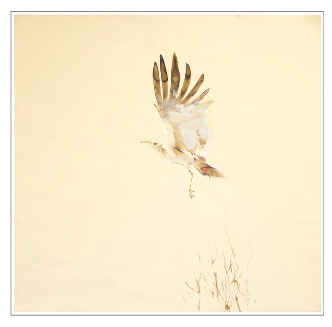
"Cappuccino Bird" Ink on cotton paper (np grey) h:84cm x w:79cm SOLD