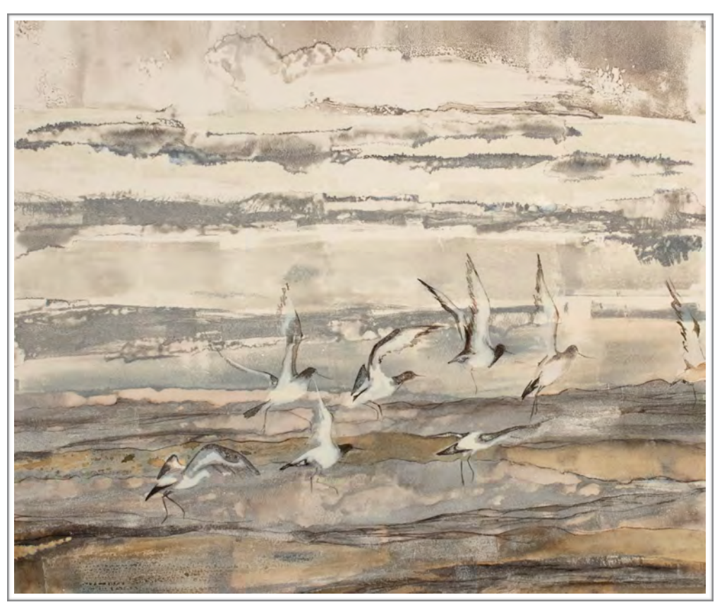
"Estuary" Monoprint on cotton paper h:33cm x w:25cm SOLD