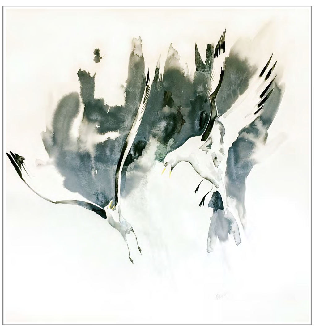
"The Interloper" Ink on cotton paper h:122cm x w:114cm SOLD