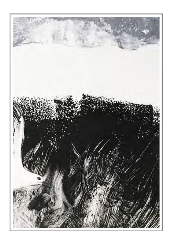
"Incoming" Monoprint & ink h:42cm x w:35cm