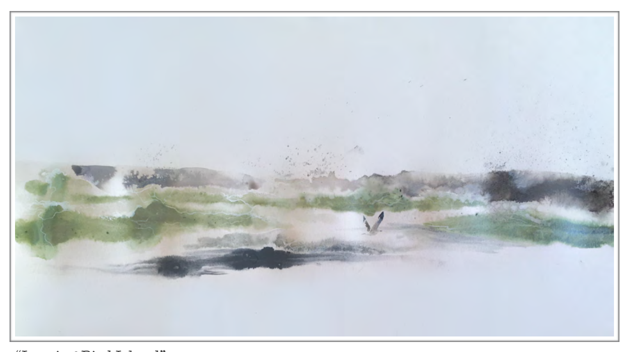
"Leaving Bird Island" Ink & pencil on cotton paper h:54cm x w:80cm