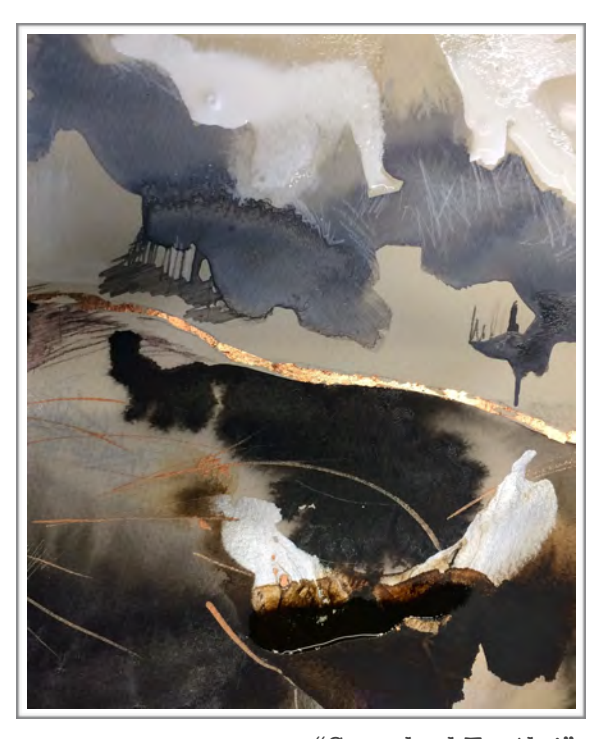
"Scorched Earth i" Ink, pencil & copper leaf on cotton paper h:33cm x w:25cm SOLD