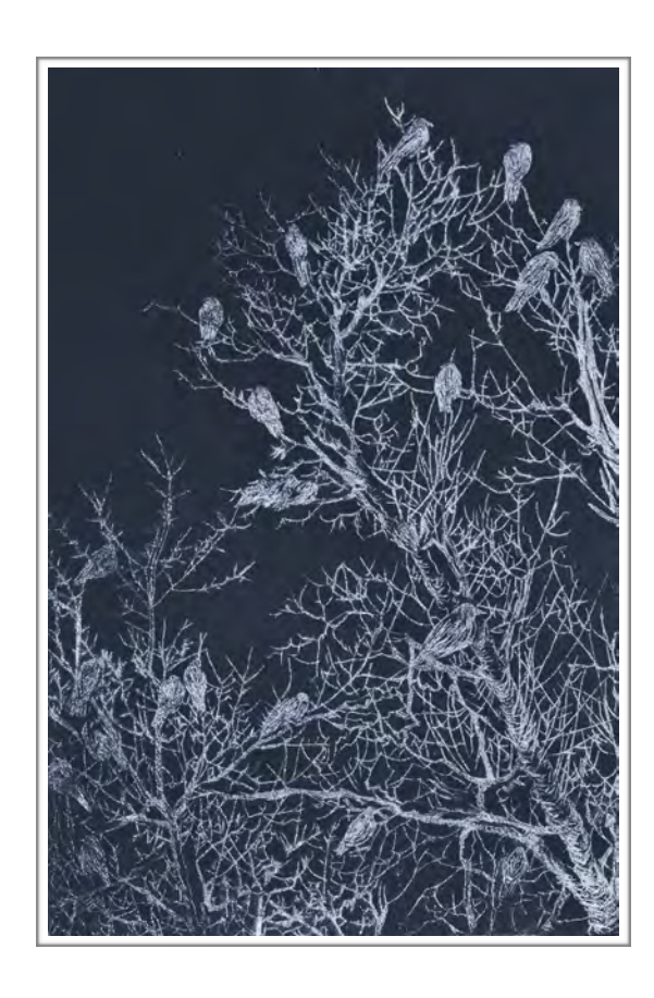
"Pause" Drypoint etching /4 h: 42cm x w:35cm