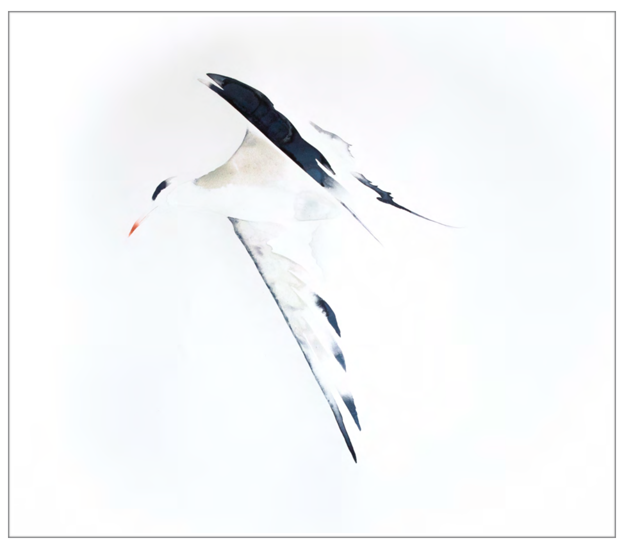
"Sylph" Ink on cotton paper h:91cm x w:91cm