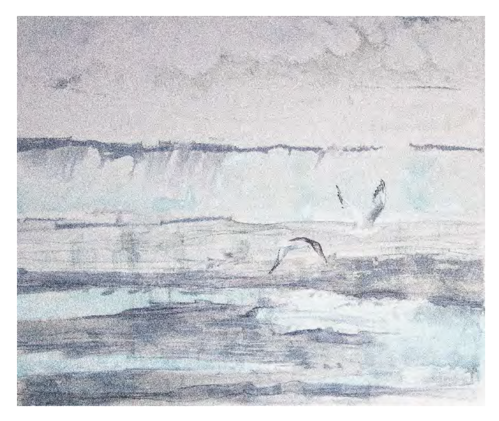
Eilbhe Donovan: Fading from View / Monoprint on cotton paper, 63 \times 75 \text{ cm}

None of her pieces are the same size - the image and the subject dictate the format and size of the work. Working initially within a far larger size, the finished image is scaled down by tearing, a precise procedure done by hand that can ruin a piece if not executed correctly. Each work is glassed and framed using UV Museum glass to protect from fading, UV and reflections.