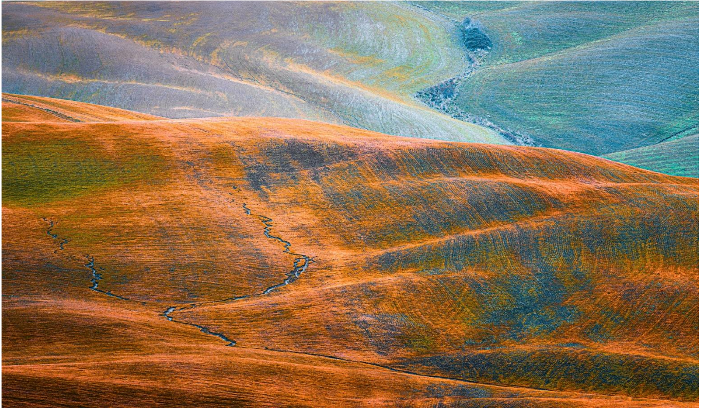
Marek Boguszak: Acrylic glass print, photography