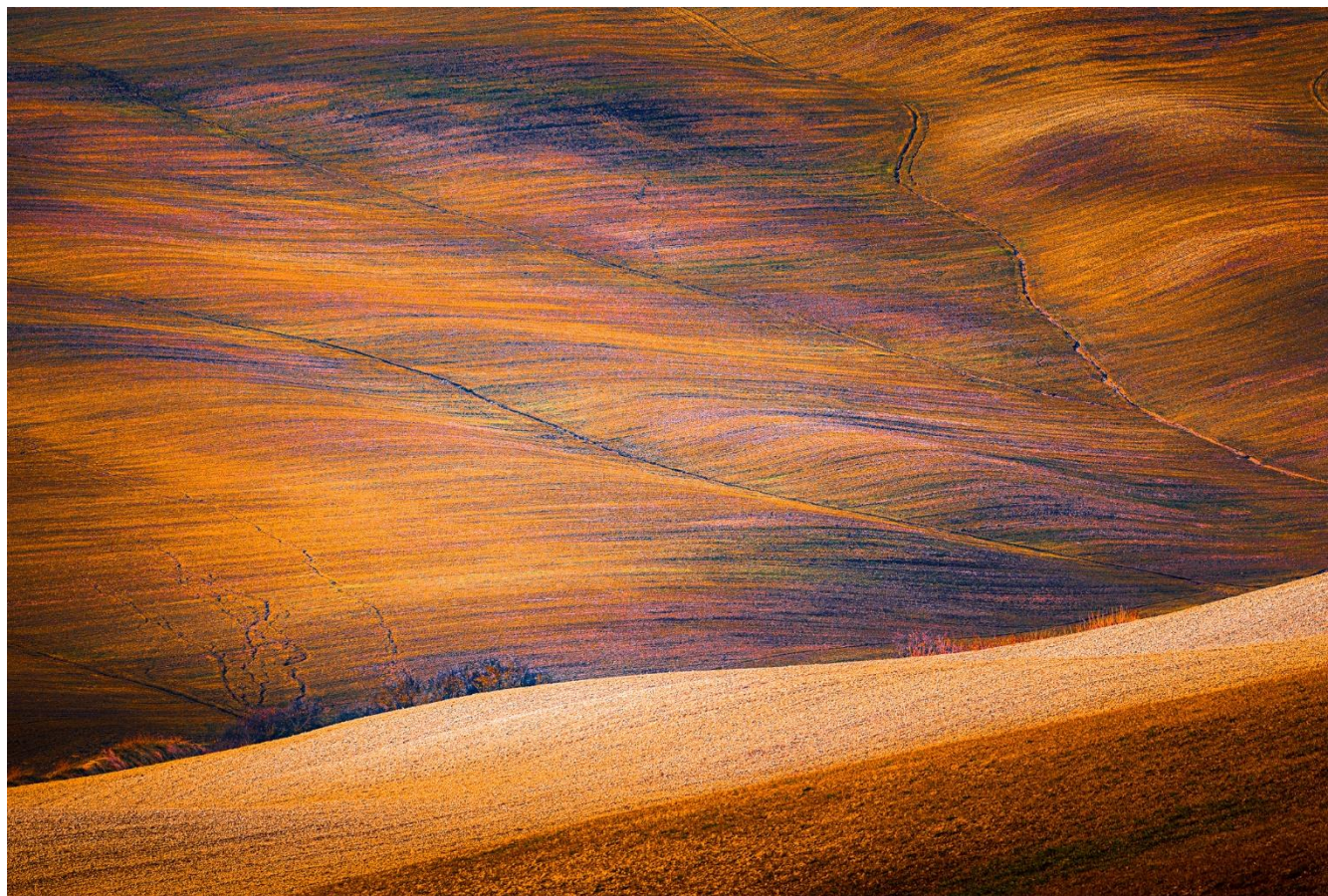
Marek Boguszak: Acrylic glass print, photography