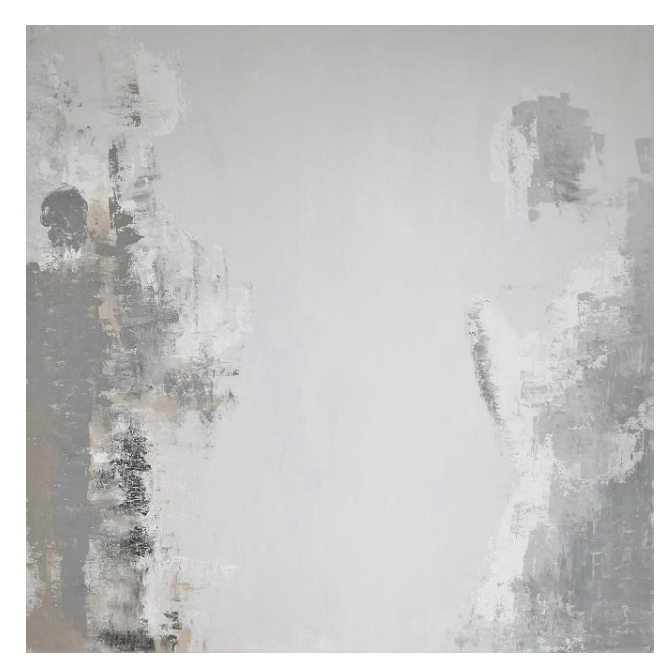
NULL SERIES 002 Acrylic, quartz sand on canvas 100cm x 100cm 2018